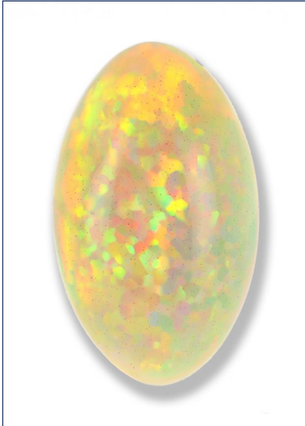
Figure 4: This 15.8 ct opal from Ethiopia was examined for this report.

character and rounded columnar structure) and its chemical composition (high Ba concentration; Rondeau et al. 2010). The inclusions were identified by Raman micro-spectroscopy as cinnabar (HgS). Energy-dispersive X-ray fluorescence (EDXRF) chemical analyses of